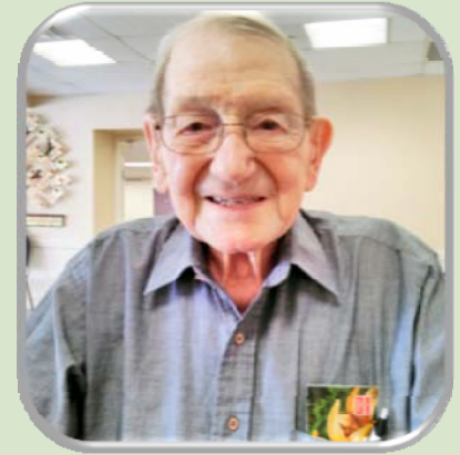
Cliff Michaels Residential Apartment

"I'm very pleased that I chose this homey place for my wife and myself. The care she received when she was ill was very loving! I like it here so much. The people are very nice, and I've made good friends."